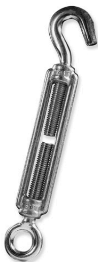
Tensor gancho anilla Acero Fe 430B